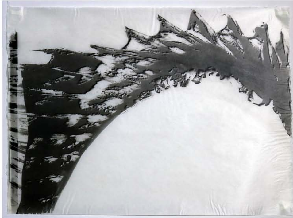
Striped Bass (2020) palladium on Japanese gampi paper

ALICE GARIK www.alicegarik.com alice@alicegarik.com 646 493 6865