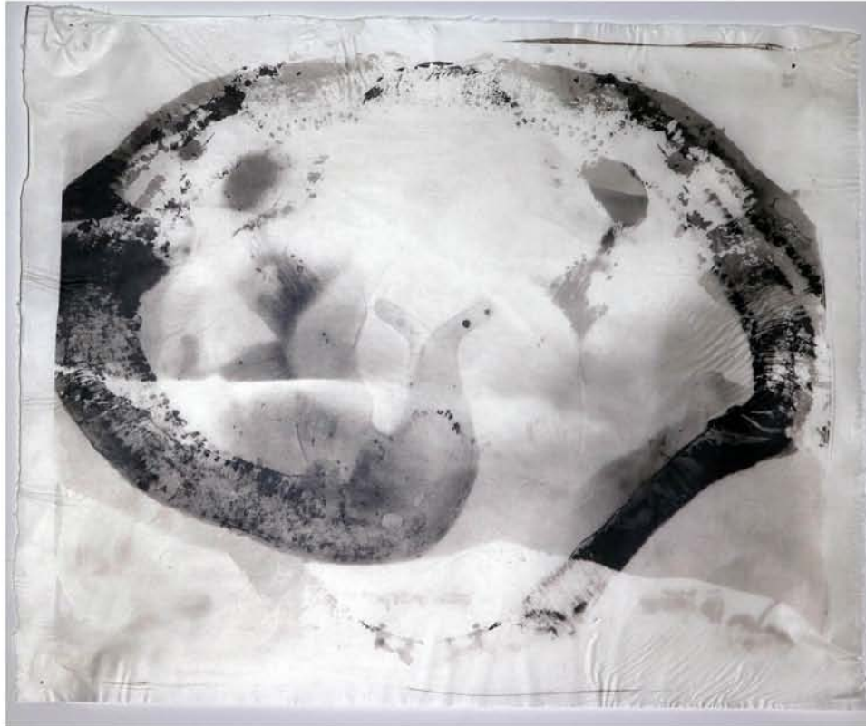
Scallop Eyes (2020) palladium on Japanese gampi paper

ALICE GARIK www.alicegarik.com alice@alicegarik.com 646 493 6865